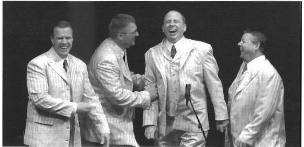
2010 International Quartet Champions