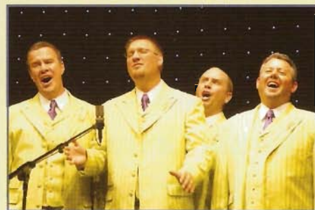
2010 BHS INTERNATIONAL QUARTET CHAMPIONS