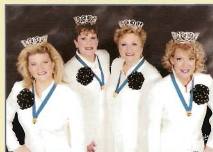
2011 SWEET ADELINES INTERNATIONAL QUARTET CHAMPIONS