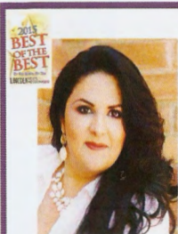
Realtor Associate License # 01318668